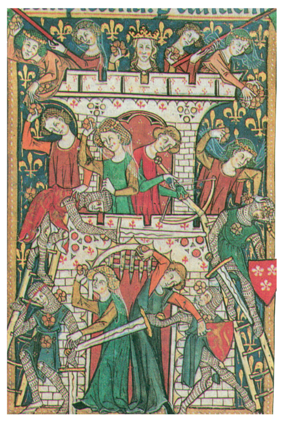
▲ The noblewomen depicted in this manuscript show their courage and combat skills in defending a castle against enemies.

As you have read in this section, the Church significantly influenced the status of medieval women. In Section 4, you will read just how far-reaching was the influence of the Church in the Middle Ages.